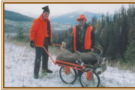
Two miles behind a Forest Service gated road - with a 5-point Muley Buck!!