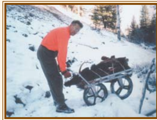
No Trail. . . in rough terrain. . . with a fine spike bull Elk.

NEET KART® Two-Wheel-In-Line Concept & Principle Patent # 6,811,179