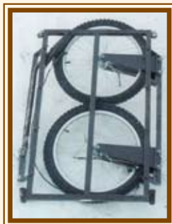
Folded For Storage